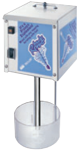
BW11 – Wall Mount