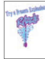
052071-ADV 6" x 8" Window/Door Cling