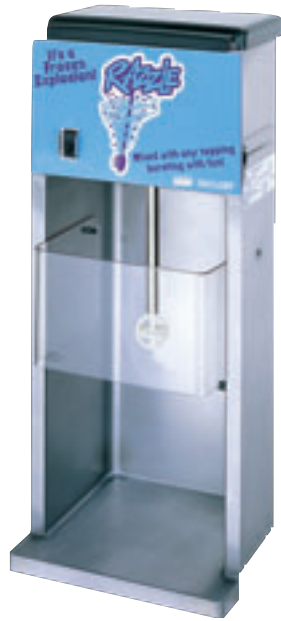
BC10 – Countertop