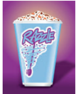
052075-ADV 21" x 12-1/2" Illuminated Razzle Cup