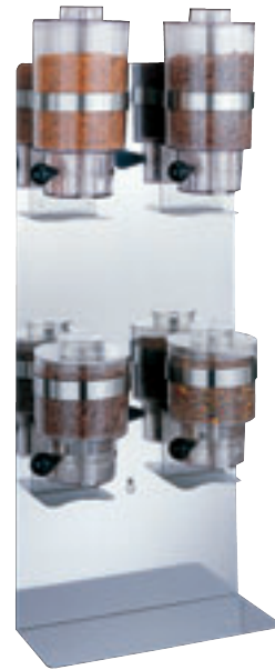
X52037-1 High Volume Kit