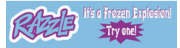
052073-ADV 4' x 2' Outdoor Banner