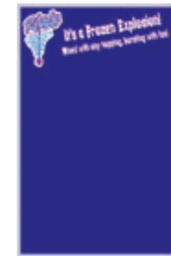
052074-ADV 24" x 36" Dry Erase Menu Board