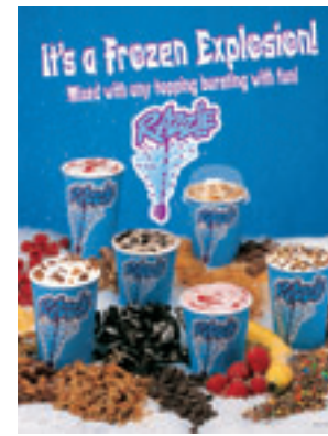
052069-ADV 18" x 24" Poster

Ask your local Taylor distributor for information on counter top dispenser kit or plastic dispensers which are also available.