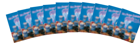
052068-ADV 3 3/4" x 5" Table Tent