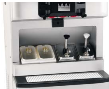
Integrated Syrup Rail Option - 2 room temperature with lids & ladles, 2 heated with syrup pumps

During long no-use periods, the standby feature maintains safe product temperatures in the mix hopper and freezing cylinder.